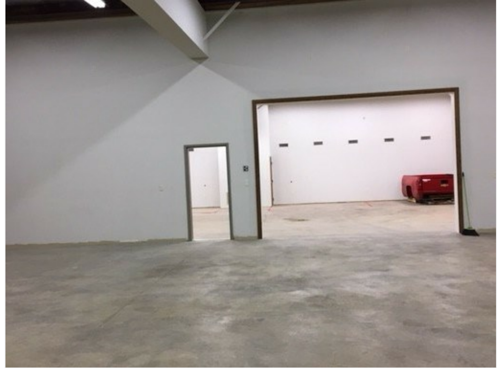
3301 Northbrook Interior3 10.19.17