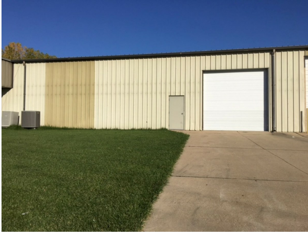
3301 Northbrook MAIN 10.19.17 (Large)