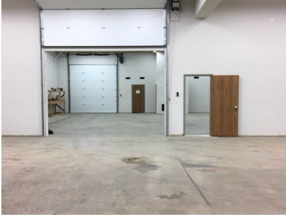
3301 Northbrook Interior2 10.19.17