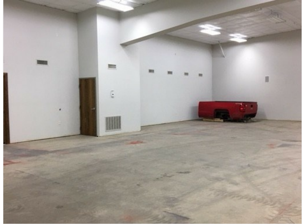
3301 Northbrook Interior 10.19.17