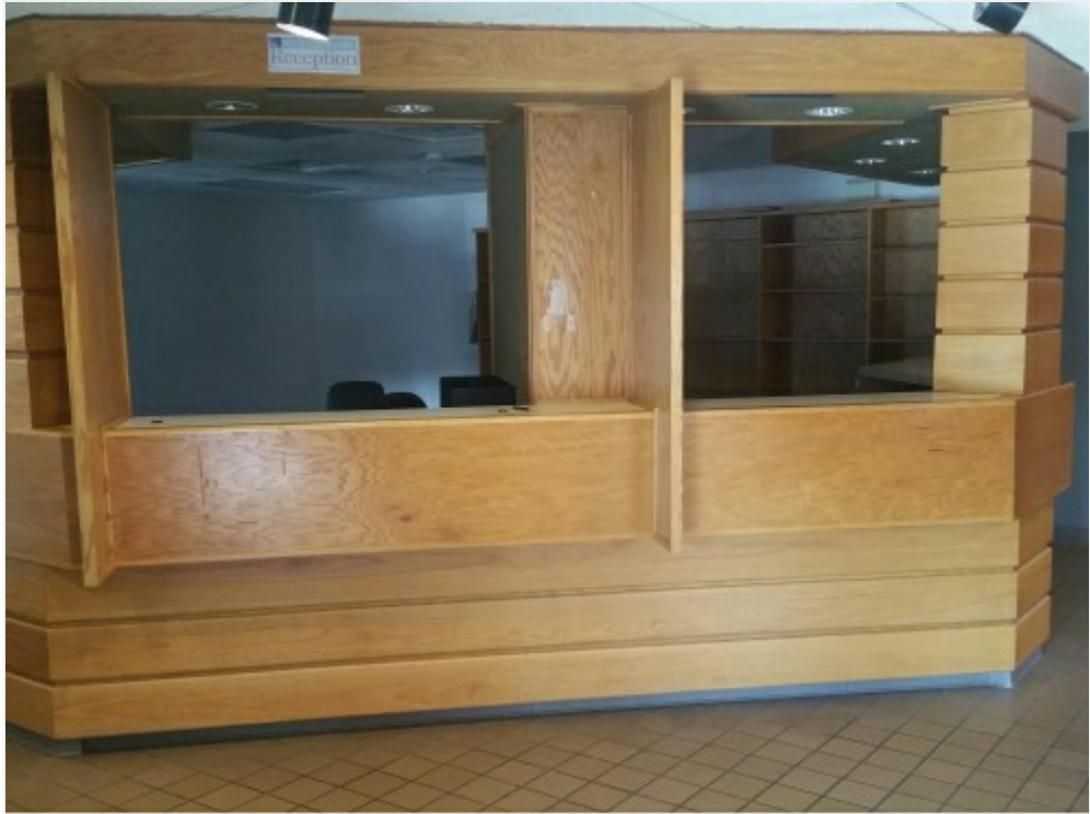
Front Reception Area