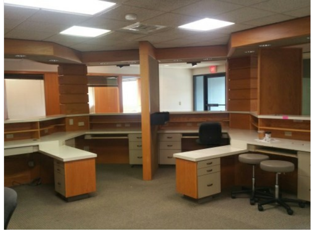
Front Reception Area (view from back)